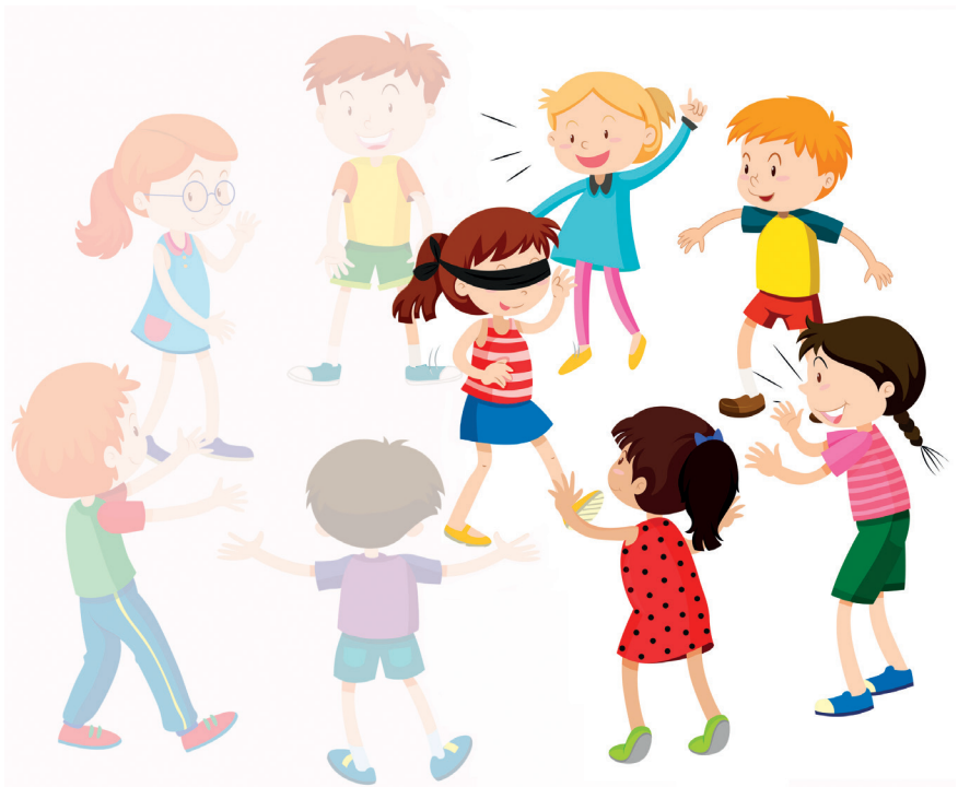
Figure 1. A child with unilateral hearing loss in a typical 'child's cocktail party' like the game above will have difficulty identifying the location of each speaker and will have trouble hearing the children on her impaired side.

Without spatial hearing, a child with unilateral hearing loss (shown in the centre in Figure 1) has to focus on other acoustic features that make each sound