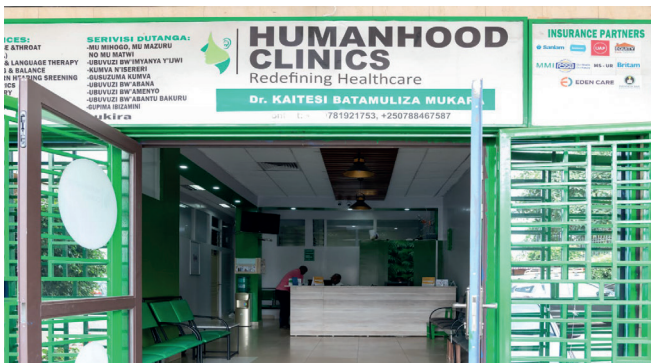
Entrance to Humanhood Clinics in Rwanda.

Rwanda is a beautiful country known as the ‘Land of a Thousand Hills’. It is located in the Great Rift Valley in East Africa and shares borders with Uganda, Tanzania, Burundi, and the Democratic Republic of Congo, all offering direct flights to the capital city, Kigali. Nairobi is just an hour’s flight away from Kigali. Rwanda is proud to showcase its natural mountainous beauty, rich cultural heritage, wildlife, MICE industry, good governance, cleanliness and security. All this makes the country an appealing destination for organisations, universities, tourism, and medical tourism.