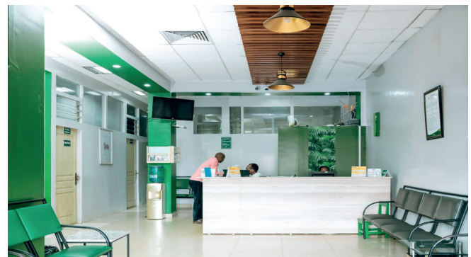
Reception area of the clinic.